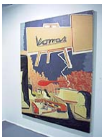
Neo Rauch Vorrat 1998 at Eigen + Art