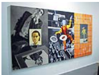
David Salle Tightrope Walker 1998 at Lehman Maupin